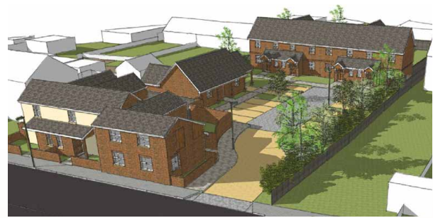
ARTIST'S IMPRESSION - ARIEL VIEW