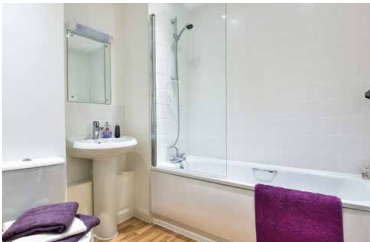
Images are from previous First Wessex properties and are for illustrative purposes only.