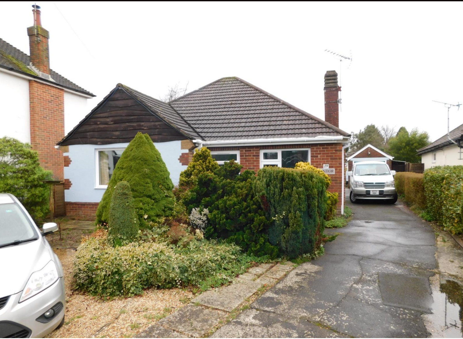
Jandor, 19 Ashleigh Close, Hythe SO45 3QN