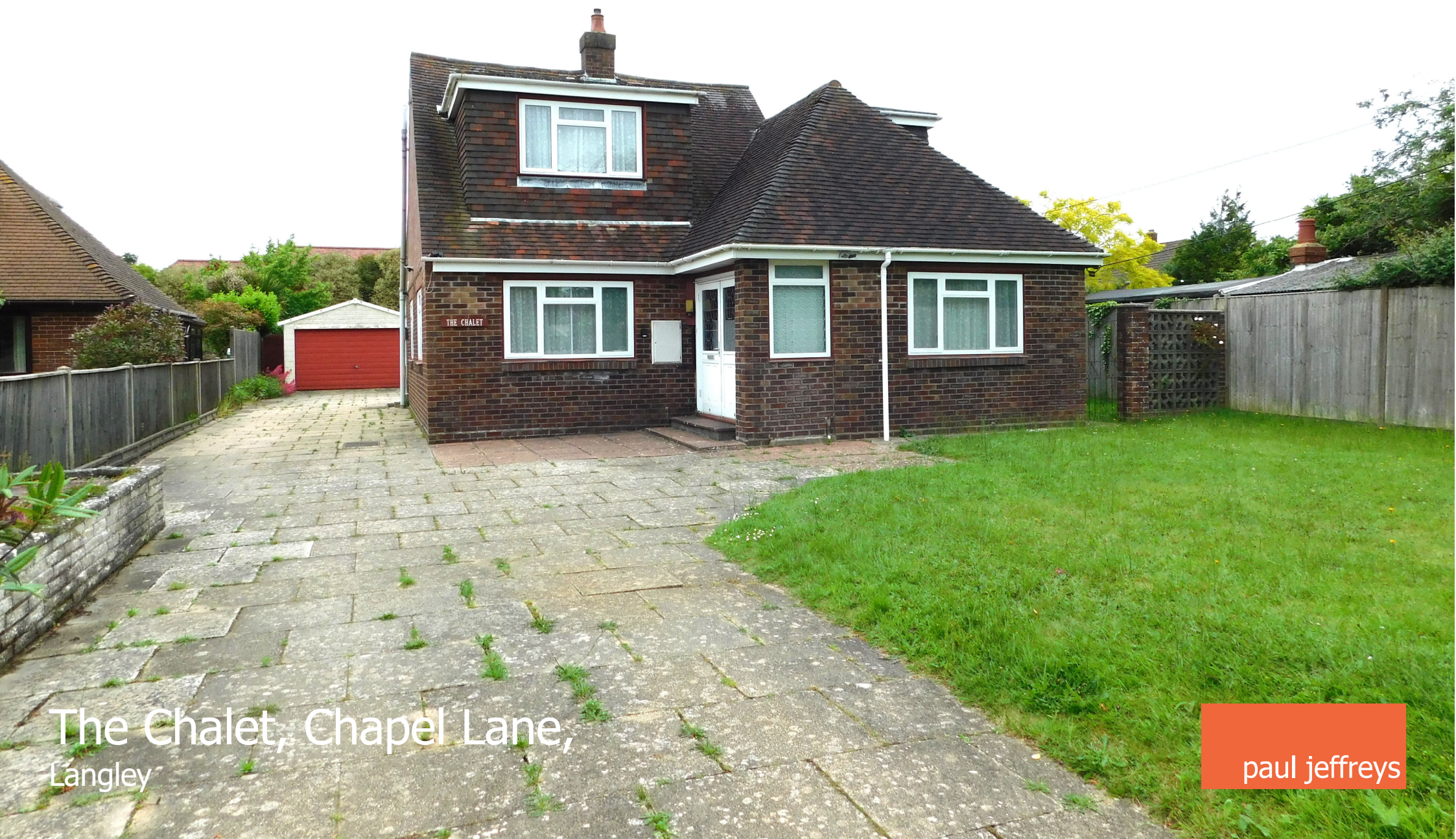
The Chalet, Chapel Lane, Langley